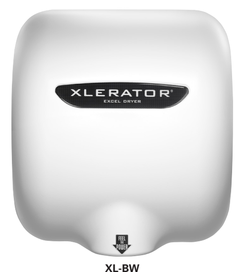
White Thermoset Resin (BMC)