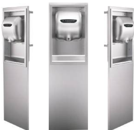
(XLERATOR Sold Separately)