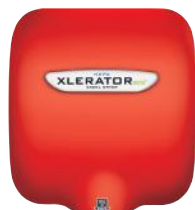
XL-W-ECO-H White Epoxy Painted

B. Control assembly is activated by an infrared optical sensor located next to the air outlet. The dryer shall operate as long as hands are under the air outlet. Control includes a speed and sound control mechanism and a filter sensor which is activated should the filter become clogged. There is a 35-second lockout feature if hands are not removed. Sensor equipped with externally visible red LED that flashes error codes to assist in troubleshooting.