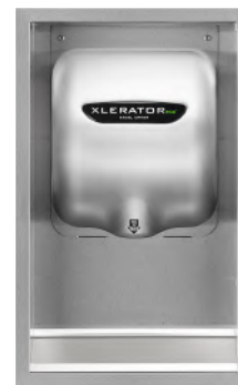
Part # 40502