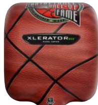
XL-SI-ECO⁴ Custom Special Image