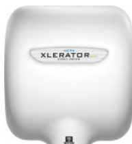
XL-SP-ECO-H³ Custom Special Paint