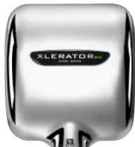
XL-C-ECO Chrome Plated