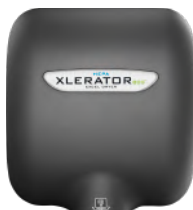
XL-GR-ECO-H Graphite Textured Painted