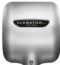
XL-SB-ECO Brushed Stainless Steel