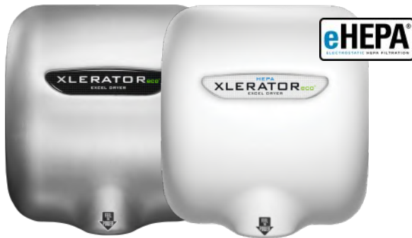
XL-SB-ECO Brushed Stainless Steel

MODELS: XL - BW W GR C SB SI SP - ECO OPTIONS: -H (HEPA Filter) -1.1N (Noise Reduction Nozzle) -VOLTAGE (See Chart)