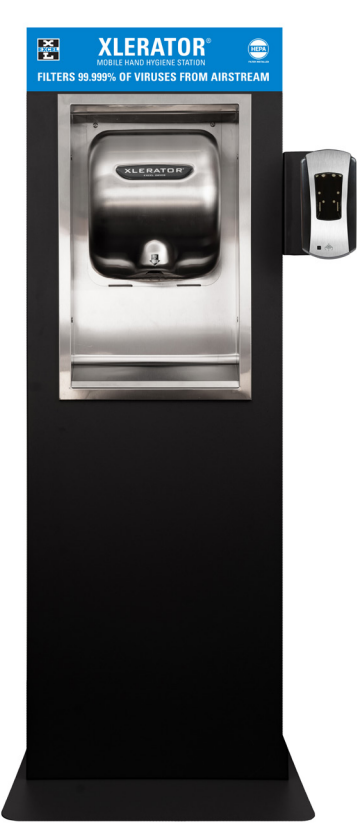
Hand Sanitizer Dispenser Not Included

The World Health Organization And Centers For Disease Control and Prevention List Proper Hand Hygiene As Top Defense Against The Spread Of Germs Like The Coronavirus.