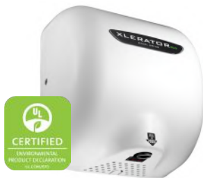
XL-BW-ECO White Thermoset Resin (BMC)

MODELS: XL - BW W GR C SB SI SP - ECO OPTIONS: -1.1N (Noise Reduction Nozzle) -H (HEPA Filter) -VOLTAGE (See Chart)