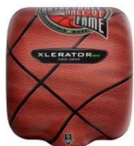
XL-SI-ECO*** Custom Special Image