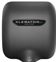
XL-GR-ECO Graphite Textured Painted