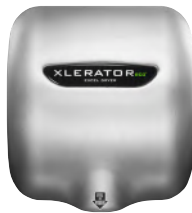
XL-SB-ECO Brushed Stainless Steel