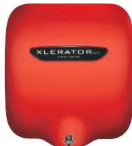
XL-SP-ECO** Custom Special Paint