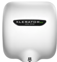
XL-W-ECO White Epoxy Painted