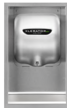
Part # 40502