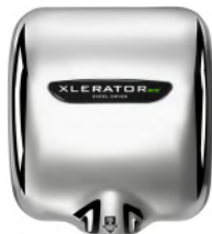
XL-C-ECO Chrome Plated